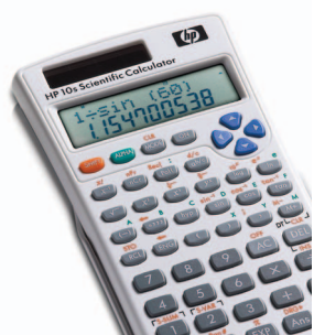
Dual Power: Solar and battery